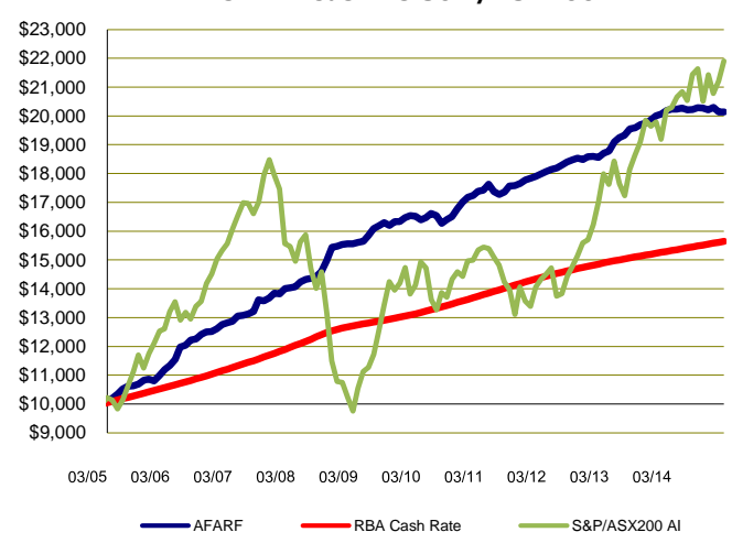
AFARF* vs RBA Cash vs S&P/ASX200AI*

We research various criteria and reasons to invest in particular situations. These criteria may pertain to fundamental and quantitative analysis, company event situations such as takeovers and mergers, demergers and restructuring, liquidity events, recapitalisations, multiple share classes, option availability and pricing. Once an investment decision is made, the implementation of the trade is conducted in parallel with an active focus on risk management. The Fund uses derivatives for risk management as well as to create new positions.