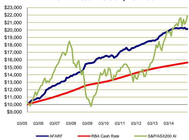
AFARF* vs RBA Cash vs S&P/ASX200AI*

We research various criteria and reasons to invest in particular situations. These criteria may pertain to fundamental and quantitative analysis, company event situations such as takeovers and mergers, demergers and restructuring, liquidity events, recapitalisations, multiple share classes, option availability and pricing. Once an investment decision is made, the implementation of the trade is conducted in parallel with an active focus on risk management. The Fund uses derivatives for risk management as well as to create new positions.