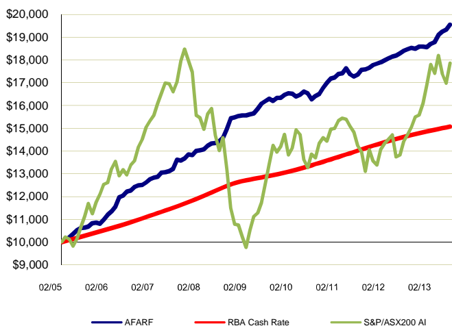
AFARF vs RBA Cash vs S&P/ASX200AI ($)

Within the implementation of this strategy, the Investment Manager believes that the Australian equity market presents franking credit opportunities that are being ignored and/or mispriced by the market. As such, the Fund seeks to take advantage of these opportunities as they arise.