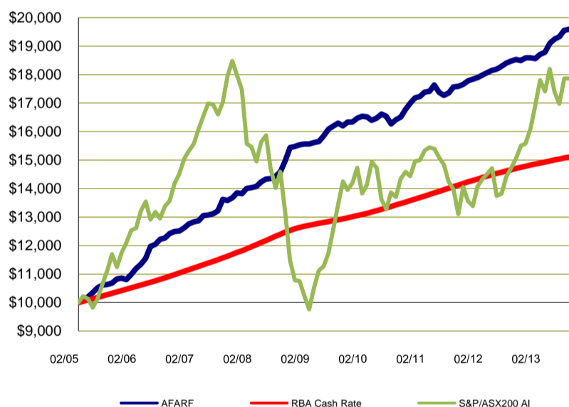
AFARF vs RBA Cash vs S&P/ASX200AI ($)

Within the implementation of this strategy, the Investment Manager believes that the Australian equity market presents franking credit opportunities that are being ignored and/or mispriced by the market. As such, the Fund seeks to take advantage of these opportunities as they arise.